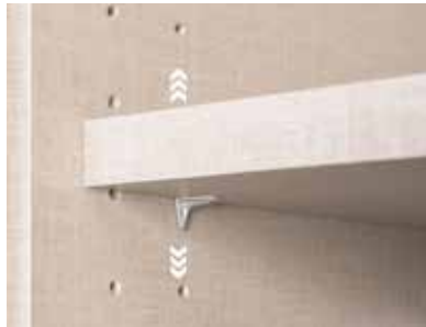
16 mm shelves