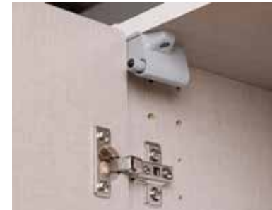
Metal pot hinges, Optional ampers for hinged doors