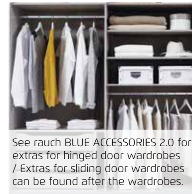
See rauch BLUE ACCESSORIES 2.0 for extras for hinged door wardrobes / Extras for sliding door wardrobes can be found after the wardrobes.