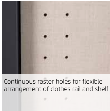
Continuous raster holes for flexible arrangement of clothes rail and shelf