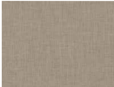
Interior colour Texline colour