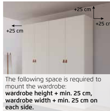
The following space is required to mount the wardrobe: wardrobe height + min. 25 cm, wardrobe width + min. 25 cm on each side.