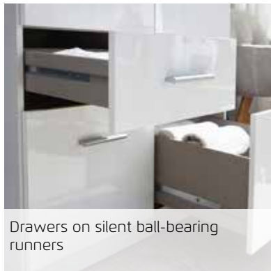
Drawers on silent ball-bearing runners