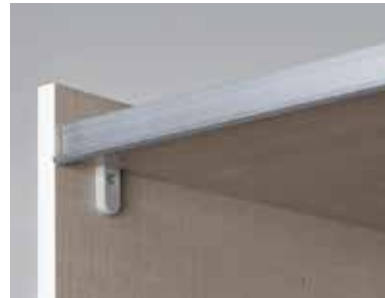
Metal guide rails, Optional dampers for sliding doors